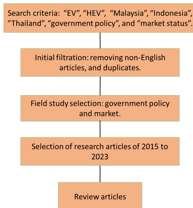
Fig. 2. Literature review process