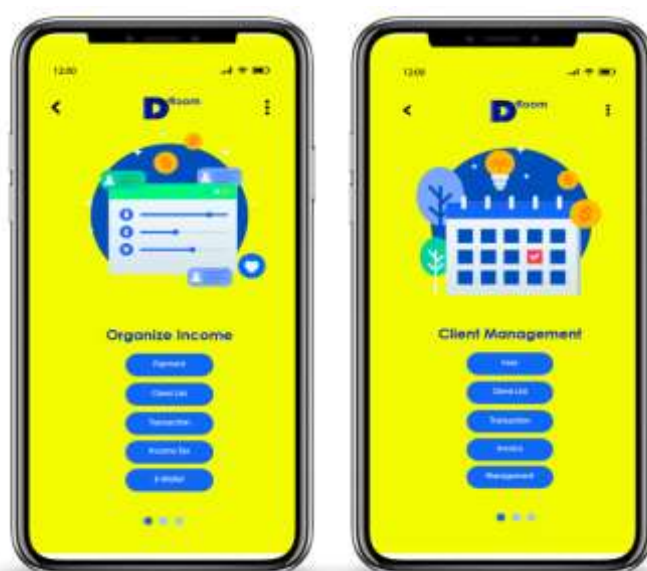
Fig. 2. Mobile mode features in the D'ROOM Designer Professional Solution application (organize income and client management)

Navigating through the diverse offerings of the D'ROOM application, users gain access to a comprehensive array of job categories tailored to various sectors within the design industry. From graphic design and industrial design to UI/UX design and beyond, these curated categories facilitate seamless job searching and networking opportunities. By exploring and engaging with these job categories, users can proactively pursue new professional opportunities, connect with potential clients, and expand their professional network within their specialized field.